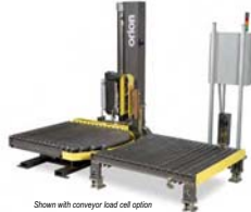
Shown with conveyor load cell option