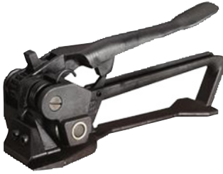
PPI-1620 Heavy Duty Feedwheel Pusher Tensioner Strap Gauge (.023 to .031) Strap Width Range (3/4" to 1 1/4")