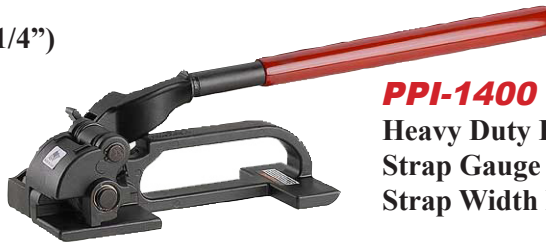
PPI-1400 Heavy Duty Feedwheel Tensioner Strap Gauge (.025 to .031) Strap Width Range (3/4" to 1 1/4")