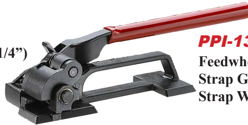
PPI-1300 Feedwheel Tensioner Strap Gauge (.015 to .025) Strap Width Range (3/8" to 3/4")