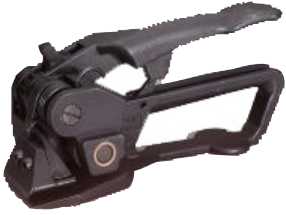
PPI-1610 Compact Feedwheel Pusher Tensioner Strap Gauge (.015 to .025) Strap Width Range (3/8" to 3/4")