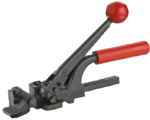
PPI-1860 Heavy Duty Rack & Pinion Pusher Tensioner Strap Gauge (.023 to .031) Strap Width Range (5/8" to 1 1/4")