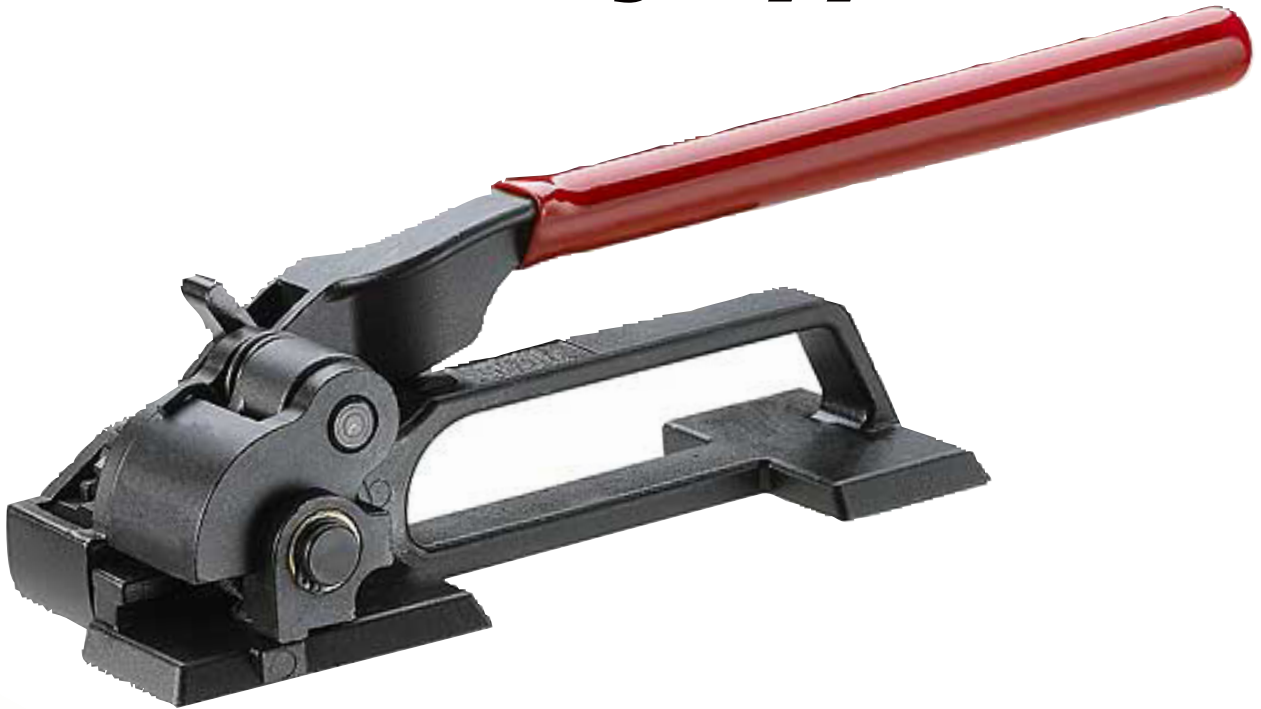
Rack & Pinion

PPI Hand Tools: The Right Tool For Any Application