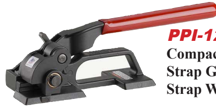
PPI-1200 Compact Feedwheel Tensioner Strap Gauge (.015 to .023) Strap Width Range (3/8" to 3/4")