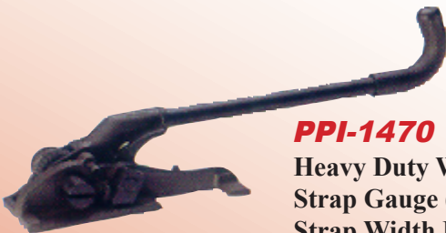
PPI-1470 Heavy Duty Windlass Tensioner Strap Gauge (.028 to .035) Strap Width Range (3/4" to 1 1/4")