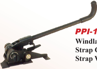
PPI-1450 Windlass Tensioner Strap Gauge (.028 to .031) Strap Width Range (3/4" to 1 1/4")