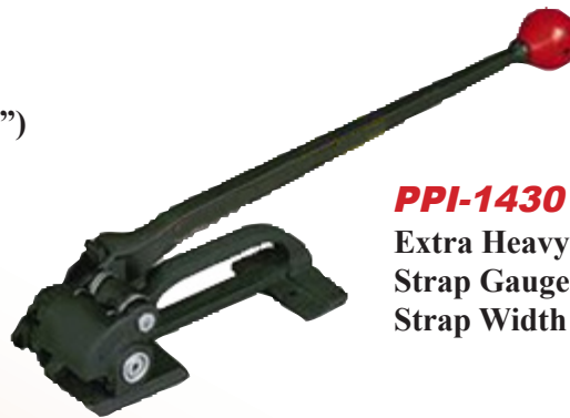
PPI-1430 Extra Heavy Duty Feedwheel Tensioner Strap Gauge (.025 to .035) Strap Width Range (3/4" to 1 1/4")